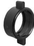
Winged Coupling Ring W/14482