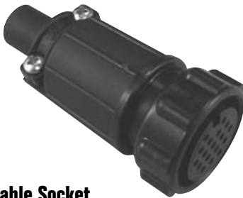
Cable Socket 13X8X-XXSG-XXX Matching Mates: • Cable-Cable 15X8X-XXPG-XXX • Panel 14XXX-XXPG-XXX