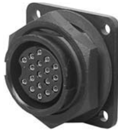
Panel Mount 14X8X-XXXG-XXX Matching Mates: • Cable Pin 13X8X-XXPG-XXX • Cable Socket 13X8X-XXSG-XXX