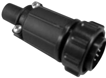
Cable Pin 13X8X-XXPG-XXX Matching Mates: • Cable-Cable 15X8X-XXSG-XXX • Panel 14XXX-XXSG-XXX